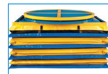
Accordion bellows skirting