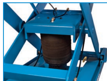
Unique Patent-Pending, Self-Contained Pneumatic System Offers Unsurpassed Performance