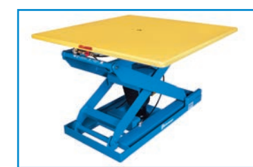
Oversize rotating platform