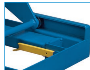
Rollers Are Entrapped In The Base Frame And Platform For Added Stability

The Bishamon EZ-Loader Complies With All Machinery Directive 2006/42/EC Safety Requirements - And Is CE Approved!