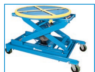
Cart portability with 2 swivel and 2 fixed caster wheels