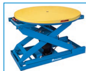
Solid rotating top