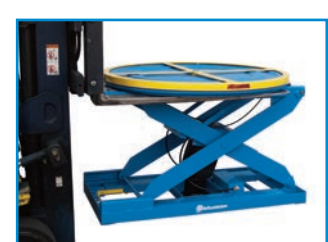
Easily moved with a fork truck