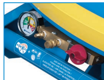
EZ-Adjust Knob Provides Up To 1200 lbs Of Capacity Adjustment With the Turn of a Knob